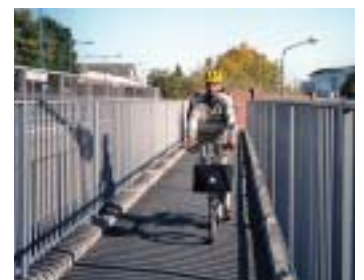
Safety parapets on bridges to protect cyclists must be 1.4m high

Parapets and safety railings that protect cyclists from a drop are required to be 1.4m high for safety reasons. For pedestrians only, a 1.1m parapet is acceptable. The protection will only need to be provided at locations where there is real danger to the users. These do not include alongside all rivers or embankments.