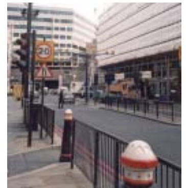
Temporary 20mph limits through roadworks will assist cyclists and can be enforced by camera

Unplanned emergency road works arising from statutory undertakers' works can result in damage to the cyclist's riding surface. As soon as such works arise, a works and reinstatement inspection routine should be put in place.