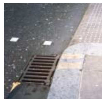
Correctly laid gully provides a level riding surface

Gully gratings must be flush with adjacent surfaces