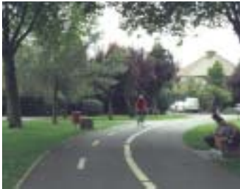
Bituminous surfaces should be laid to normal highway tolerances