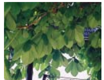
A landscape maintenance regime could have prevented these signs being obscured

Cycle tracks, adjacent paths and shared paths frequently suffer from problems of the growth of adjacent planting. This can seriously reduce the available