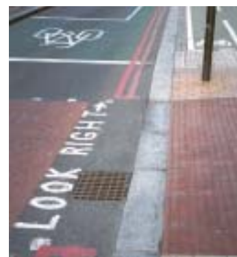
Pedestrian style grating is preferable to slot grating where cycle and pushchair routes intersect

Any areas of ponding on a cycle route that will have an adverse effect on cyclists should be addressed, including where splashing from a carriageway onto an adjacent cycleway occurs.