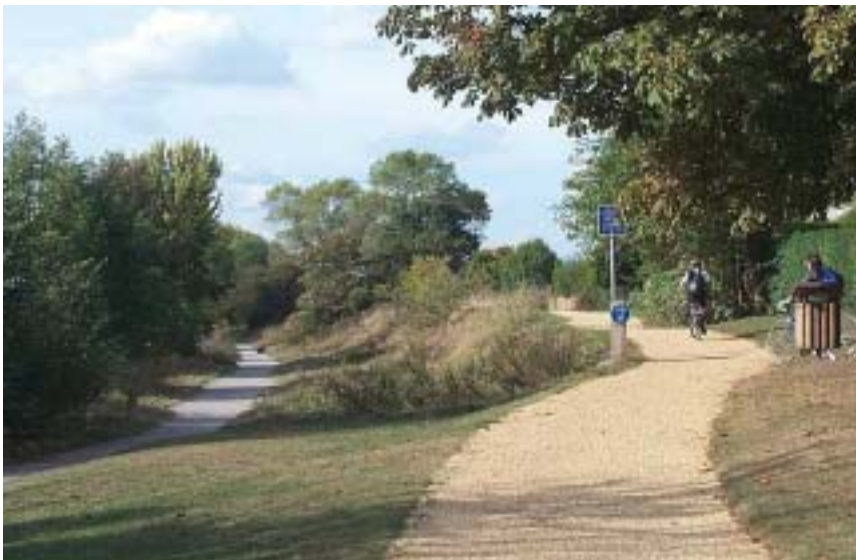
Pea-shingle surface dressing on Type 1 granular material base on Thames Cycle Route in Kingston

Adequate edge restraint should normally be provided in the form of edging to restrict the deformation and erosion of the track. Standard 50x150mm concrete edging is normally suitable, which can be laid flush to allow water run-off, or raised as a low (50mm) kerb if adjacent to a pedestrian way if required. Alternatively kerbs (125x150mm) either bull-nose, battered or half-battered can be used. Kerb-faces of 50-100mm should be used, 50mm being preferable for cyclists, but 100mm may be more appropriate to deter over-running and to facilitate drainage falls. See also section 7.6 for further kerb information.