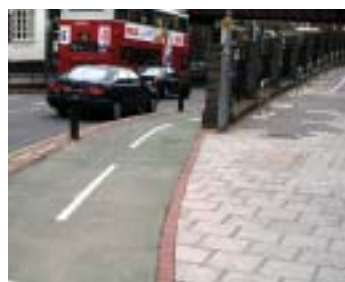
Clear delineation between cycle track and pedestrian space using brick battered kerbs