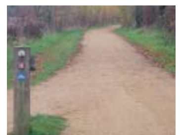
Treatment that respects the quality of the Richmond park environment

Unbound surfacing such as gravel (hoggin) is only recommended for lower usage recreational routes, due to problems with deterioration of the surface caused by weather and use by traffic. These surfaces will also result in more road grime on cycles. Routes likely to be used by commuters and utility cyclists should always be hard surfaced.